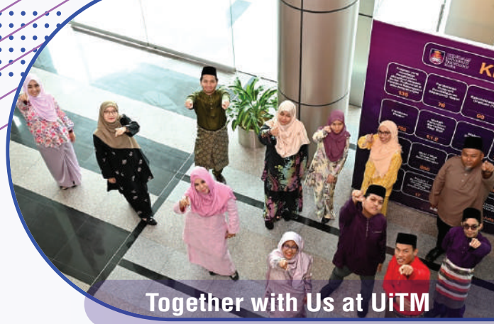
Together with Us at UiTM

Creating a learning and working environment that is disability-friendly and inclusive, U-DServeD UiTM plays a crucial role in ensuring the welfare and rights of Persons with Disabilities (PWDs) at UiTM are protected and upheld.